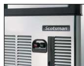
Front ON-OFF Switch Routine Maintenance Alarm