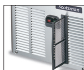
Proximity condensor air filter